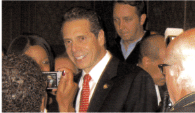
Upstate and downstate, voters show strong support for Proposition 1.

to sanction the building of up to seven casino gaming resorts in New York State, with two projected for our local area.