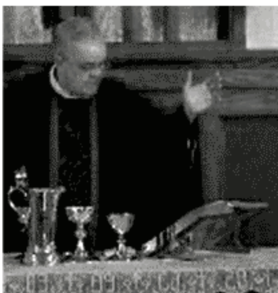
Communion vessels, as shown in this photo, were stolen from St. Paul's Lutheran church in Narrowsburg.

Thieves left the church office in disarray and made their way into a locked room where valuable communion ware was stored. The thieves stole four silver chalices, one silver plate (paten), one silver pitcher with a hinged lid (flagon), and one ciborium (shorter chalice-shaped vessel with a separate lid