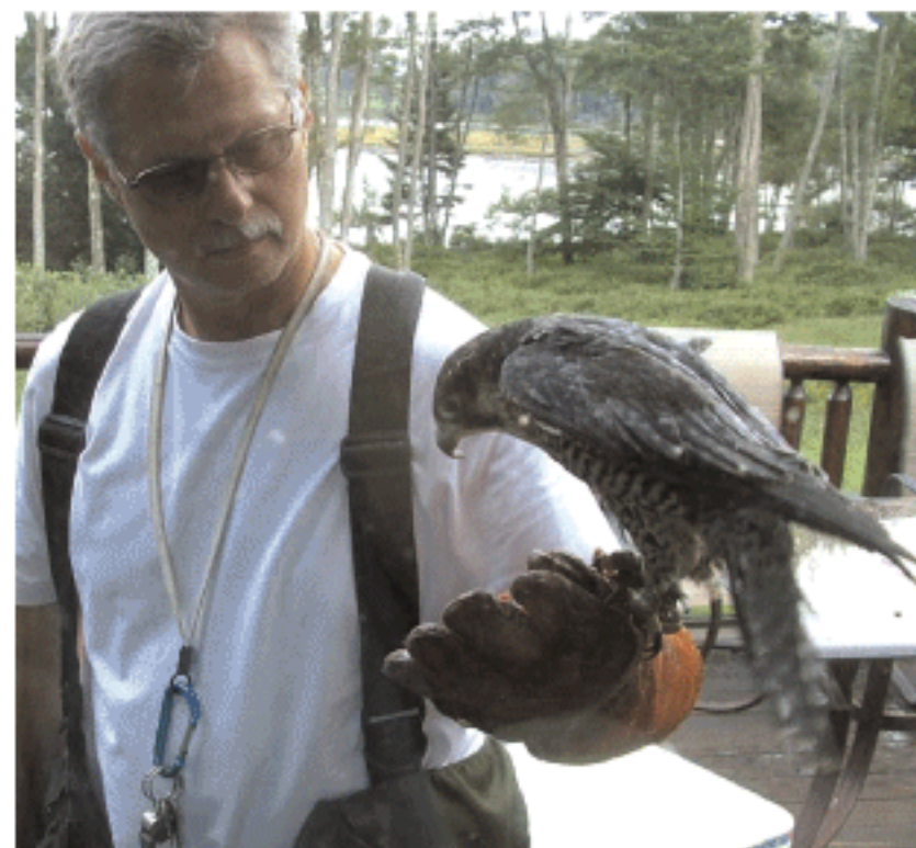
Chiavaro and female Peregrine Falcon

The public is invited to get close to these wild and powerful birds of prey throughout the day. A Birds of Prey Tent will be open from 9:00 a.m. to 3:00 p.m. Demonstrations will be held in the LMCS gymnasium at 9:30 a.m. and 11:00 a.m. There is also a not to be missed flying event scheduled for 1:00 p.m. on the field. (Contd. Pg. 3)